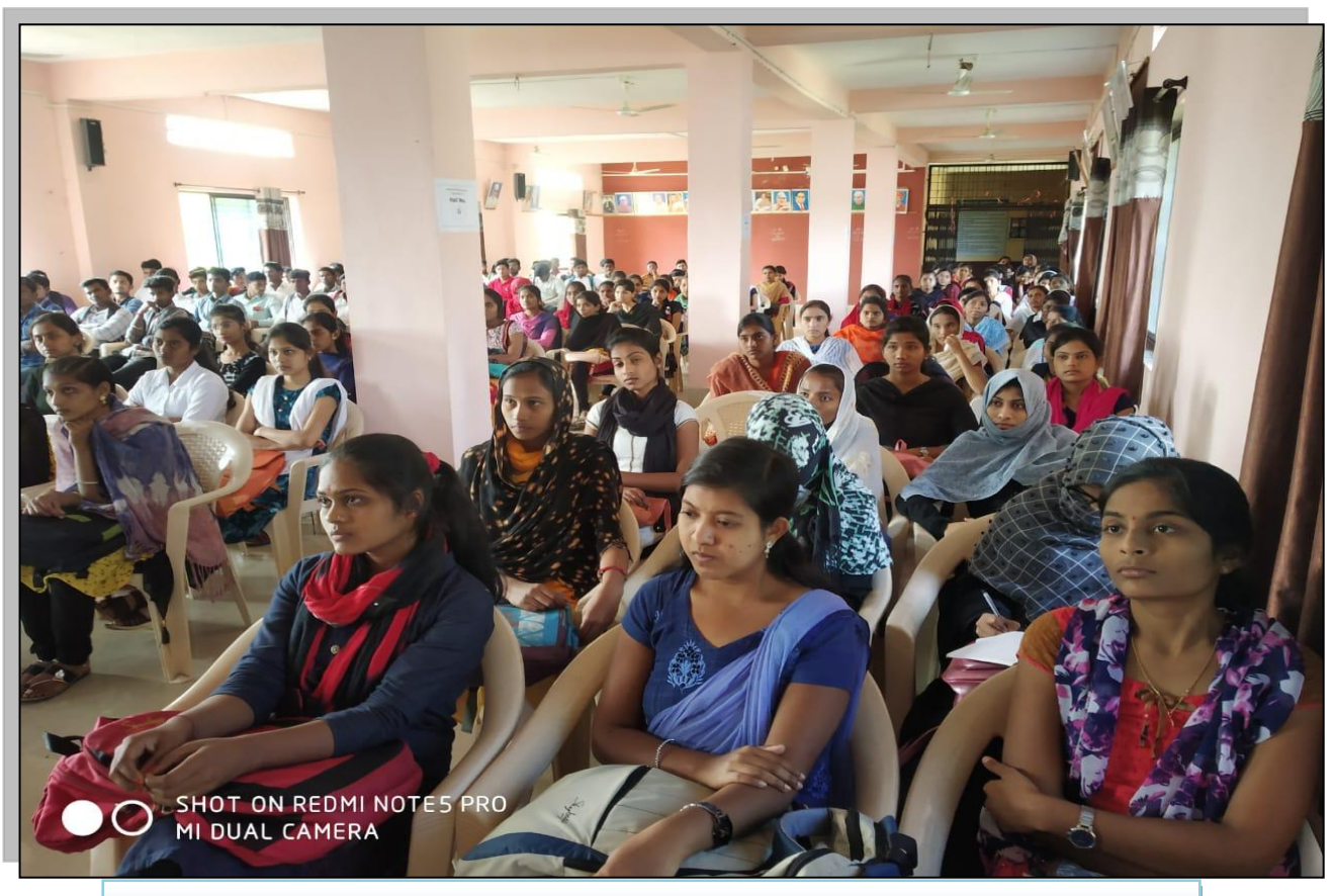
Beneficiaries: Career Guidance and Competitive examination Guest lecture