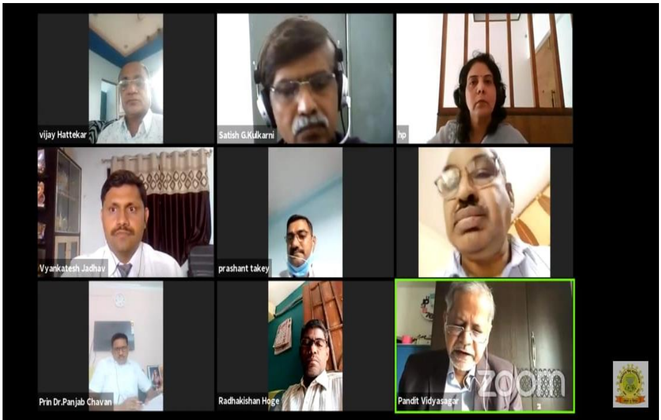
One day online Workshop Scope of new Syllabi of B.sc Second year Biophysics.